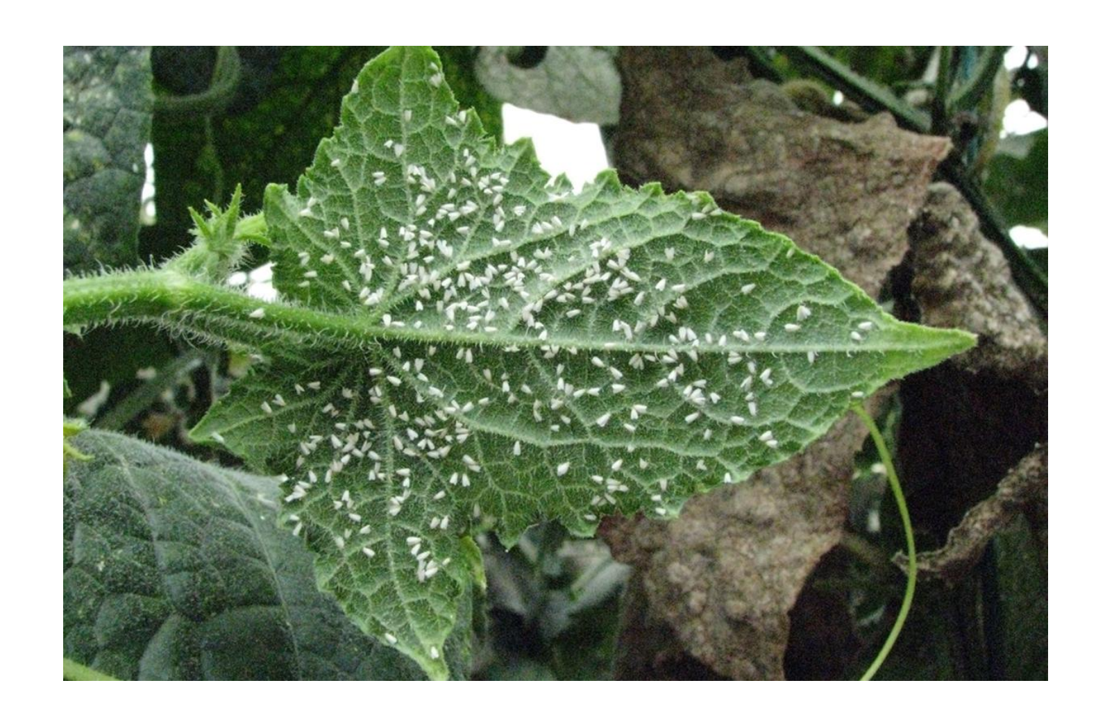
Fig 2. a) Infestation with B. tabaci